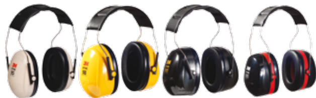
3M Peltor Optime Earmuffs: A market standard

3M Peltor Optime Earmuffs offer versatile protection that meets the needs of a majority of workplace applications.